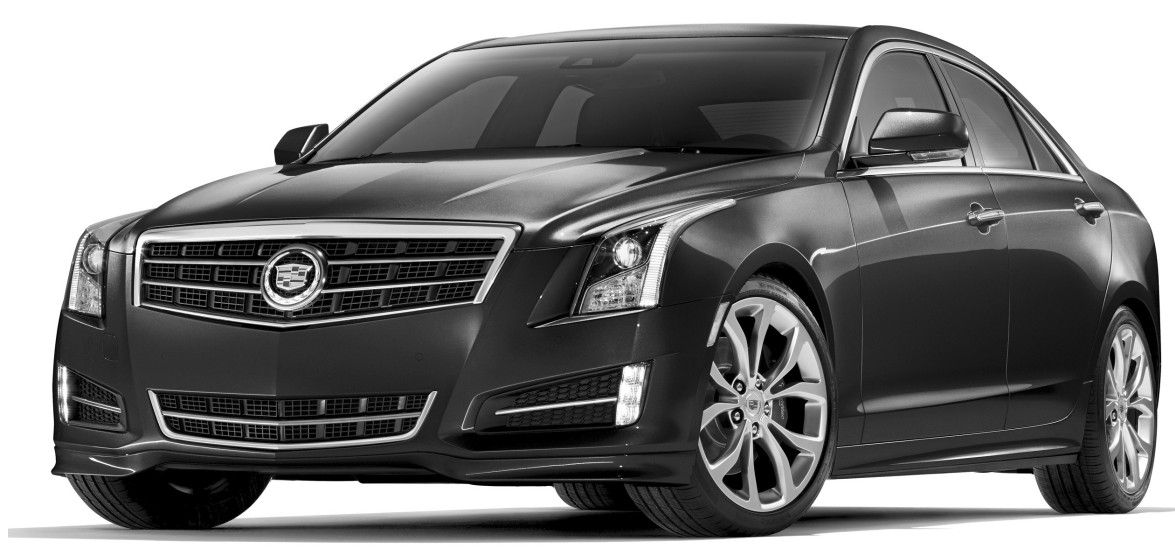
Produced only during the spring of 2014, the Cadillac ATS Crimson Sport Edition sedan is characterized by its unique Crimson Red Metallic exterior paint and a collection of its sportiest performance attributes, including an available Track Package.